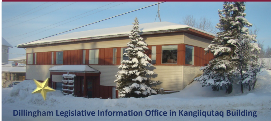
Dillingham Legislative Information Office in Kangiigutaaq Building